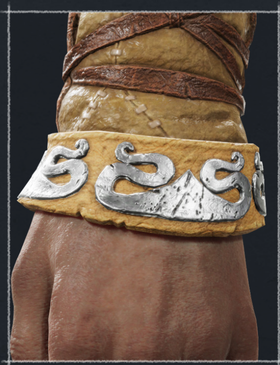
Burnished pewter cuff ornaments